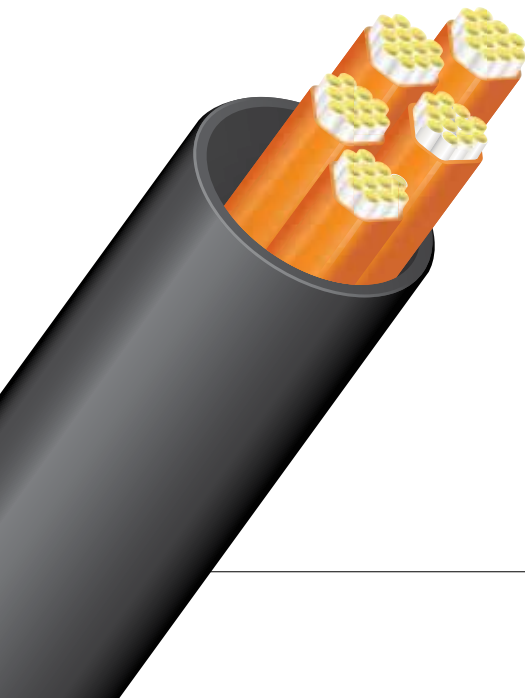
FIGURE 3: 4-in main conduit divided into 60 bidirectional pathways with bundled microducts.

Microfiber cables and microducts are shipped on smaller and lighter reels. Shipping costs, labor requirements and reel-handling equipment and essentials are reduced. Because of the reduced diameter cables involved, bend radii are tighter and storage requirements reduced, such as in the case of handholes or cabinets needed for storage of slack optical fiber cables. The outer sheaths and buffer tube walls of microfiber cables are thinner than those in traditional cables. This means that the prep process is more craft sensitive, and there are some differences with cable prep and fiber access. Applicable