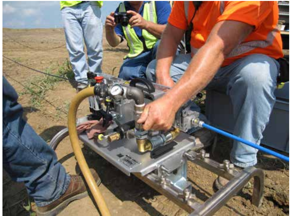
FIGURE 1: Jetting microcable into microduct in an OSP environment.

Methods for calculating cable pulling tensions were developed in the mid-1980s by the Electric Power Research Institute (EPRI). Its mission was to develop tools that could be used for calculating cable pulling tensions based on the system layout as it was being designed. Pulling tensions could not exceed cable tensile strength. This was at a time when a growing percentage of cables were being placed underground and new trenchless installation methods, such as horizontal directional drilling (HDD) and chute and pull plowing,